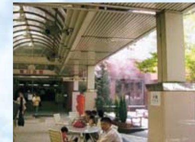
TENMAYA in Okayama (department store)