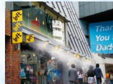
LOFT in Shibuya, Tokyo (shopping center)