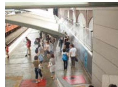
Universal City station