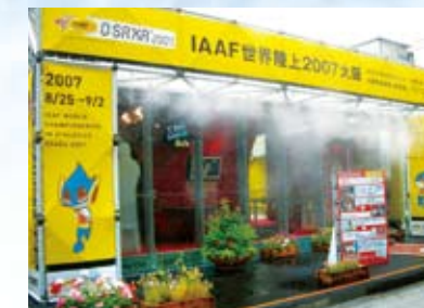
IAAF World Championships in Athletics, Osaka 2007