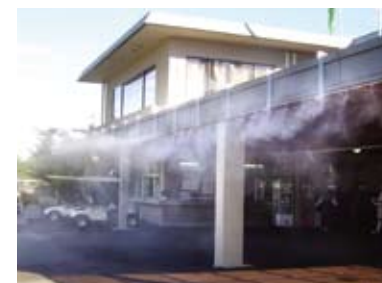
Arima Royal Golf Club