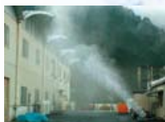
CLJ-590D in operation

COOLJetter® is a combined unit of a fan and nozzles that can blow Semi Dry Fog® further and wider by the fan air flow. Applicable over a wide range of use with non-wetting fog that other similar products don't have. The Large-size CLJ-590D is ideal for both cooling and dust suppression.