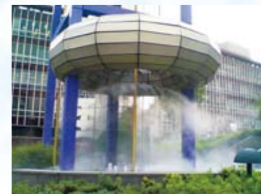
Shibuya ward office