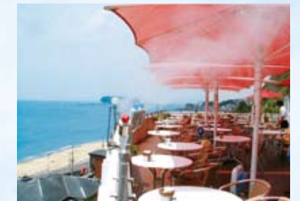
Restaurant "Amalfi Della Sera"