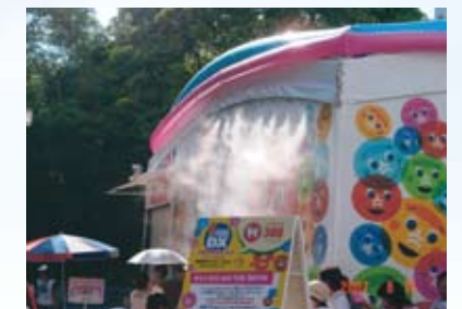
Event "Waku Waku Takarajima"