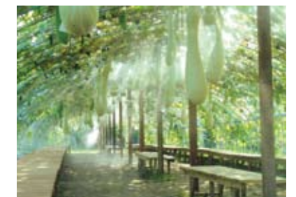
Nagai Botanical Garden