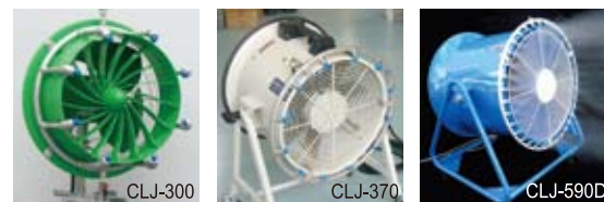
CLJ-300, CLJ-370 and CLJ-590D requires a high-pressure pump (optional). Select a suitable one from the chart to the right.

*Noise level is the mean value of those measured at 1.5m behind and both sides of the fan. *For CLJ-300 and CLJ-590D, shape of the fan base (foot) differs with or without optional features. *Adding the 90-degree oscillation option to the CLJ-590D base makes product code CLJ-590, which is IP44 compliant.